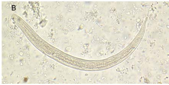
Fig. 1 Intestinal helminthes collected from stool samples: egg of hookworm (A), rhabditiform larva of Strongyloides stercoralis (B) showing short buccal cavity and prominent genital primordium, and eggs of Taenia sp (C).