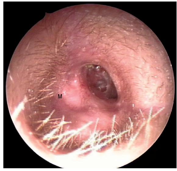
Fig. 2 Endoscopic view of the external auditory cavity showed a large dry round shape and healthy canal after the obliteration (M = area of obliterated mastoid)

Fifteen patients were operated on during the study periods. There were nine males and six females whose age ranged from nine to eighty-one years. Table 1 shows details of each patient including indication, type of flaps, and result of the final external ear cavity. Follow-up period ranged from six to 42 months. All patients had a good dry external ear cavity except one who had a discharging ear due to accumulated keratin. The healing period took about six to eight weeks before getting a satisfactory dry cavity. The postauricular wound healed nicely without any morbidity at the donor site. The external ear cavity looked near normal in shape and size, and was mostly larger than the previous one (Fig. 2). The pockets in attic, aditus, antrum, and sinudural angle were successfully obliterated and replaced with substantial healthy tissue as well as healthy skin covering. Some degree of atrophic change of the flap was noticed in five cases (33%) after the six-month follow-up period. It occurred mostly at the distal part resulting in small pockets at