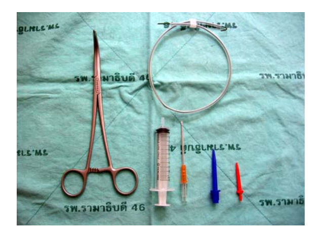
Fig. 1 Percutaneous tracheostomy kit (Portex; Hythe, Kent, UK) with curved dilating forceps code 100/540/070-090

All PDTs were performed at the bedside in the ICU and under general intravenous anesthesia. The anesthetic induction consisted of 5 mg of midazolam and atracurium 50 mg intravenously. This was followed by continuous intravenous propofol (300 mg/hr) and atracurium (30 mg/hr) for maintenance phase. All patients were pre-oxygenated with 100% oxygen for 5-10 minutes and vital signs, pulse oxymetries, and