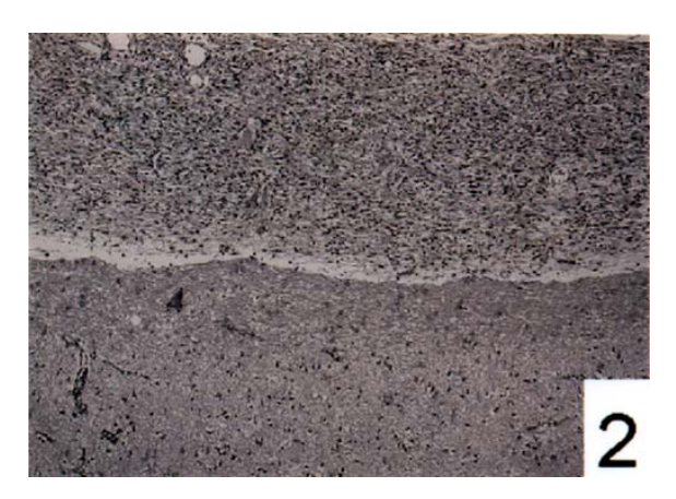
Fig. 2 DIG is clearly separate from the adjacent brain (Hematoxylin-eosin stain, original magnification x 20)

The postoperative course was uneventful, and no adjuvant therapy was given. Postoperative MRI, 4 and 8 months after operation, showed no evidence of tumor recurrence. The patient had no epilepsy and was doing well on the two-year follow up visit.