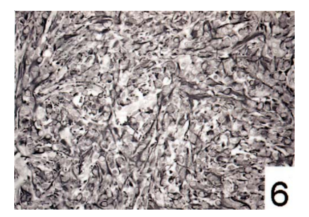
Fig. 6 Tumor cells strongly express glial fibrillary acidic protein (GFAP stain, original magnification x 200)