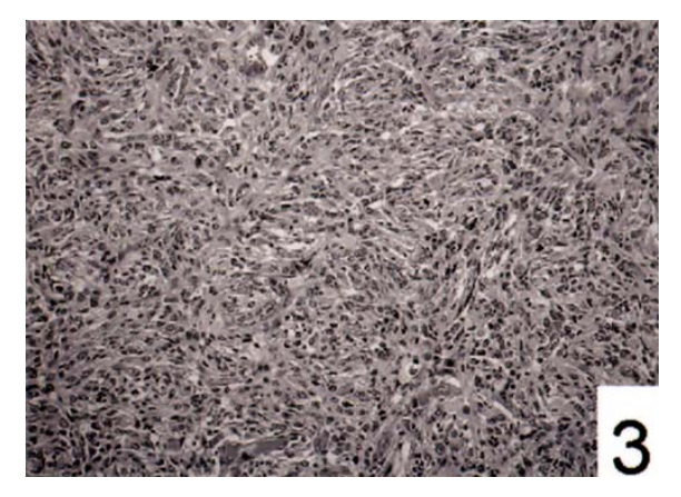
Fig. 3 Spindle-shaped tumor cells form fascicular and storiform patterns (Hematoxylin-eosin stain, original magnification x 100)