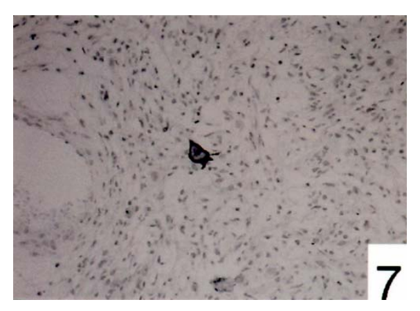
Fig. 7 A neuronal cell is highlighted with NeuN immunostain (NeuN stain, original magnification x 100)