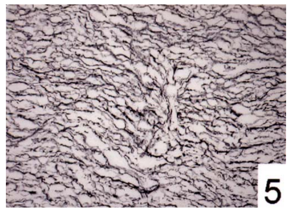
Fig. 5 Individual tumor cells are wrapped by pericellular reticulum fibers (Reticulin stain, original magnification x 100)