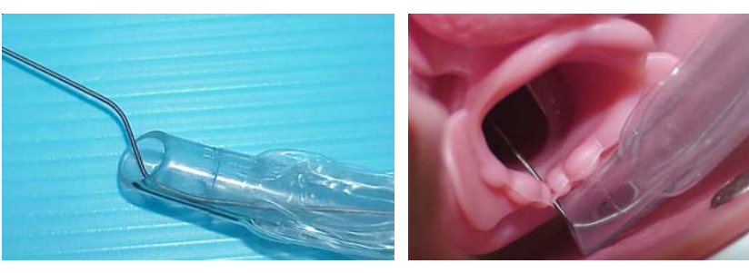
Fig. 3 Kinking of the guide-wire at the arytenoid cartilage

by a physical examination of the anatomy of the oral cavity, larynx and cervical spine mobility. If a difficult airway is foreseen, fiberoptic intubation should be attempted first. But, should this approach fail, translaryngeal retrograde wire-guided intubation should follow. However, advancement of a tracheal tube over a guide-wire is often impeded by kinking at the arytenoid cartilage (Fig. 3). In the event that both techniques fail, the hypoxia can be corrected by transtracheal jet ventilation, laryngeal mask airway, esophageal-tracheal combitube<sup>TM</sup> or surgery<sup>(4)</sup>.