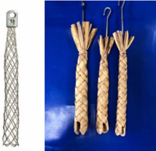
Figure 2. Steel wire finger trap and water hyacinth finger trap

Forty patients identified as 15 male and 25 female