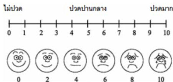
Figure 4. Visual Analogue Scale (VAS).

patients with a mean age of 47 (range 26 to 75) years in the steel wire group and a mean age of 50 (range 23 to 82) in the water hyacinth group. Twenty-four patients (60%) injured their dominant hands with 13 (65%) in the steel wire group and 11 (55%) in the water hyacinth group. A total of twenty-three patients injured their right hands and seventeen patients injured their left hands (Table 1). The calculated p-value showed no significant difference between the two groups.