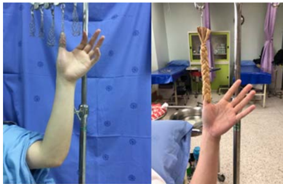
Figure 3. Application of the finger trap.