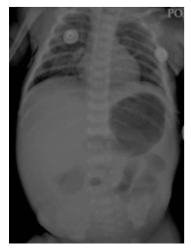
Fig. 1 Abdominal radiography on the 25<sup>th</sup> day of life after developing feeding intolerance and bleeding per rectum, demonstrated a distended stomach and several small bowel loops.

During early postoperative period, intravenous fluid replacement with 80 to 100 mEq/L of sodium and 2 to 3 mEq/kg/day of possasium was given to maintain fluid and electrolyte balance due to high nasogastric tube output. Once her metabolic and cardiovascular statuses were stabilized, a tunneled central venous catheter was placed in the right internal jugular vein and TPN administration of 80 to 90 kcal/ kg/day was provided. Postoperative ileus resolved within a couple of weeks, which she started to have bowel movement. Unfortunately breast milk was unavailable and small trophic feedings of diluted protein hydrolysate formula with medium chain triglycerides was initiated. The volume of her feedings could gradually be increased and continuous drips via nasogastric tube were tolerable. As enteral feeding was slowly advanced by concentration and volume, TPN was reduced by rate every other week. Large amount of loose stool of more than 40 ml/kg/day was replaced with isotonic solution<sup>(7)</sup>. Stool output increased as feedings were advanced. Intravenous proton pump