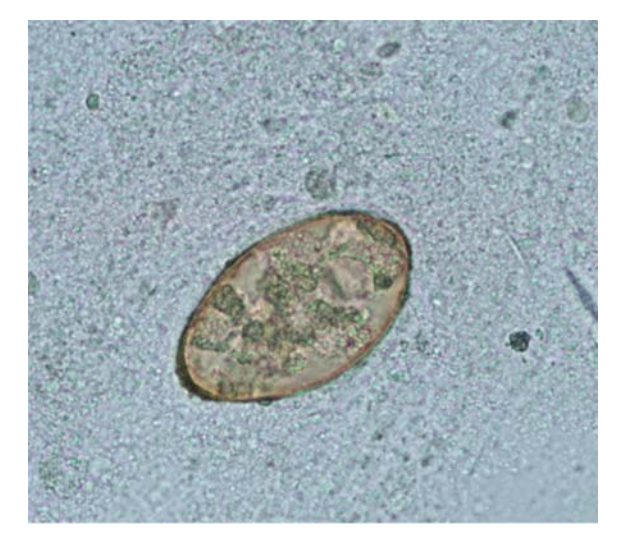
Fig. 3 Wet-mount sputum revealed egg of the genus Paragonimus . The egg was yellow-brown, ovoidal and operculated in outline with a thick shell.

eosinophilia which could be found in 62-80% of patients<sup>(13-15)</sup>. Radiographic abnormalities in Asian patients usually show air-space consolidation (52%) and pleural effusions (37%)<sup>(16)</sup>. Our patient developed consolidation with internal air bubbles at anterobasal segment of RLL. In term of definitive diagnosis, detection of paragonimiasis egg in wet-mount sputum is specific but its sensitivity is low (28-38%)<sup>(7)</sup>. Repeat sputum examinations may increase the sensitivity of this test to 50%<sup>(14)</sup>. Fortunately, in our patient we could detect Paragonimus eggs in the first sputum wet-mount specimen. Stool examination is also insensitive in adult<sup>(17)</sup>. In our patient, Paragonimus eggs were not obtained by stool concentration technique. Serological testing is useful for establishing the diagnosis of paragonimiasis because of the relatively low percentage