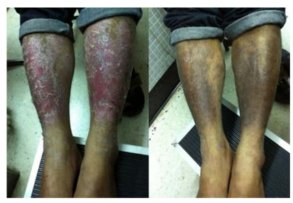
Fig. 2 PASI response of 45 mg ustekinumab subcutaneous injection (case 1) at baseline and week 12.

All patients achieved a good response to the drug with a PASI 75 improvement from their baseline PASI at week 4. The two patients (patients 1 and 4) who received two doses of 45 mg subcutaneous injections at week 0 and week 4 had more than 90% PASI improvement during treatment, and most of their psoriatic lesions had cleared at week 12 as shown in figures 2 and 3. For patients 2 and 3 who received only one treatment, there was also some improvement in their psoriasis with a PASI 75 and PASI 50 at weeks 4 and 12 respectively. One patient (patient 2) developed a superficial fungal infection on his left wrist, but no other serious side effects were detected in any patients.