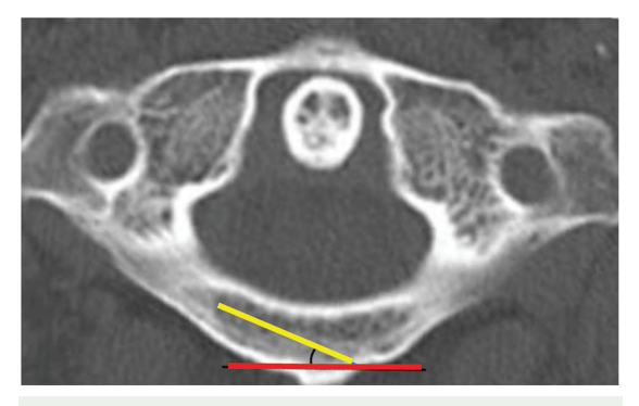
Figure 3. The yellow arrow shows the screw length, the red arrow shows the horizontal line and the black shows the screw projection angle.