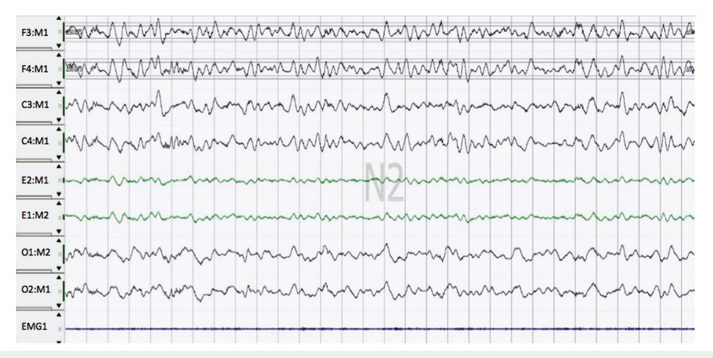
Figure 1. Polysomnographic features of atypical sleep (AS): This epoch demonstrates continuous, irregular, high-amplitude (50 to 100 \mu V) delta waves with neither K complexes nor sleep spindles, and low submental muscle activity. F3:M1 and F4:M1 are left and right frontal EEG, C3:M1 and C4:M1 are left and right central EEG. 01:M2 and 02:M1 are left and right occipital EEG. E2:M1 and E1:M2 are right and left EOG, respectively. EMG1 is submental EEG. The width of the inner horizontal lines in the frontal channels represents a 50 \mu V-amplitude.