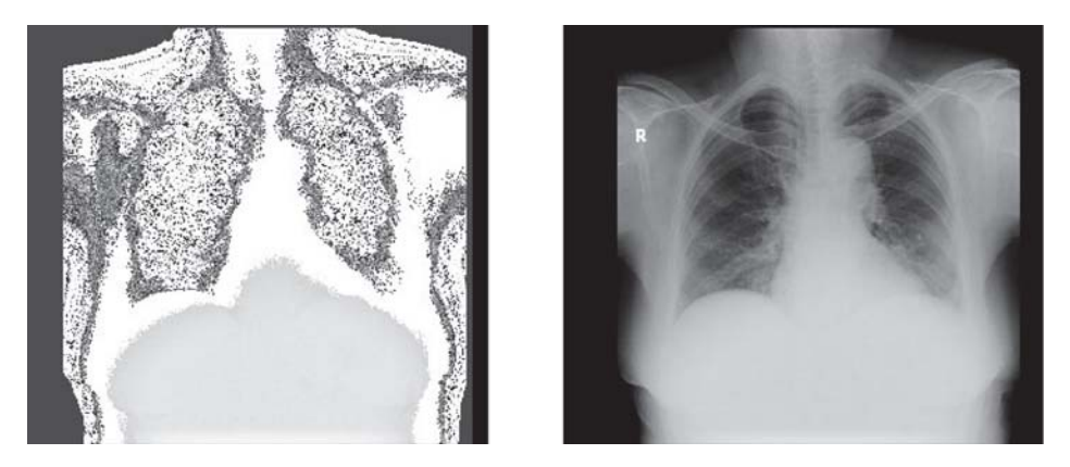
Fig. 5 Example of chest CR image before (left) and after (right) remove LUT during data migration: the LUT is embedded within CR image but the new PACS dose not support LUT. The LUT may causes bizarre visualization of image (left) that must to remove during data migration. This migration tool can be also removed abnormal LUT

The Rogan supports only one name for each patient whereas the Synapse supports two - "Patient