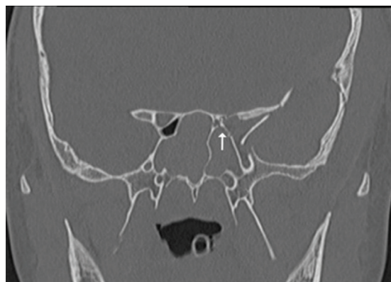
Figure 1. CT scan shows comminuted fracture of sphenoid bone compromising left optic canal (white arrow).

Endoscopic optic decompression was performed by a single neurosurgeon in the present study tertiary care academic institution. After preparation of nasal cavities with povidone irrigation and decongestant packing, the surgery was carried out utilizing 4-mm diameter and 18 cm in length, Hopkin II, 0°, 30°, 45° rod-lens endoscopes (Karl Sotrz Endoscopy, Tuttlingen, Germany). The superior turbinate was removed via a uni-nostril approach in the affected side. Then, posterior ethmoidectomy and sphenoidotomy were performed. In case of bilateral TON or inadequate exposure, bi-nostril approach was required with posterior septectomy and bilateral sphenoidotomy. After the optic canal was completely identified, fracture fragments and bone covering