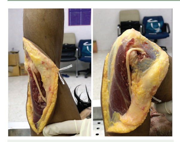
Figure 3. Tested for subluxation by passive elbow extension to full flexion.

hours. Twenty distal humeral bones were completely dissected and measured in both coronal and sagittal