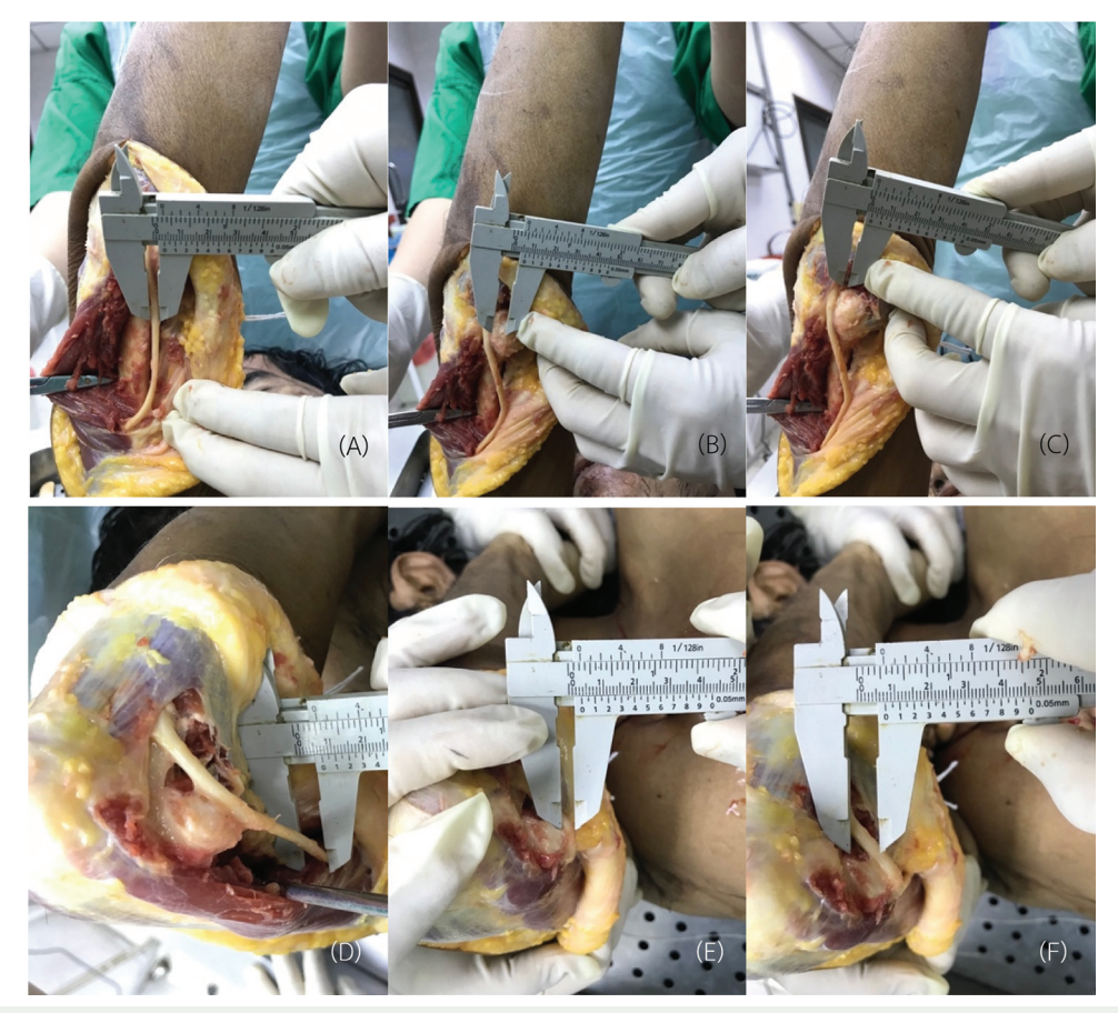
Figure 2. Measurement in the sagittal plane with Vernier caliper in 1/10 mm scale, Full elbow extension at Zone 1: The midline of the medial supracondylar ridge above Landmark 2 about 2 cm (A). Full elbow extension at Zone 2: Central of the most medial point of medial condyle of distal humeral (B). Full elbow extension at Zone 3: The midline of the medial point of the humeral trochlea (C). Measurement in the coronal plane, Full elbow flexion at Zone 1: The medial supracondylar ridge above Landmark 2 about 2 cm (D). Full elbow flexion at Zone 2: The most medial point of medial condyle of distal humeral (E). Full elbow flexion at Zone 3: The medial point of the humeral trochlea (F).