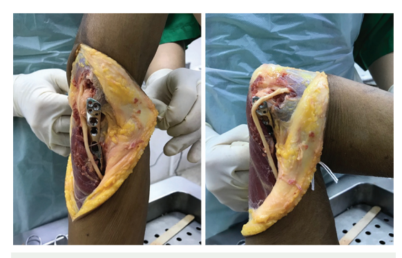
Figure 4. Tested for the area of irritation between plate and nerve by passive elbow extension to full flexion.

hours. Twenty distal humeral bones were completely dissected and measured in both coronal and sagittal