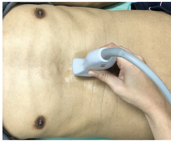
Figure 1. Probe orientation for inferior vena cava ultrasound.

This prospective observational study was conducted between September and October 2016 at the ED of Siriraj Hospital, Mahidol University, which is an academic hospital with more than 20,000 non-trauma ED visits annually. The undergraduate curriculum is a six-year program. Medical students are trained to perform FAST while they are rotating through the trauma division, surgical department, and basic obstetric ultrasound during their rotation through the gynecologic-obstetric department. None of the medical students had any experience with IVC ultrasounds. The present study was approved by the Siriraj Institutional Review Board.