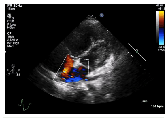
Figure 3. Color doppler echocardiography demonstrated secondum atrial septum defect.

symptoms such as cough, shortness of breath, especially during exertion, stridor, central monotonic wheezing that is refractory to bronchodilators, cyanosis, dysphagia, or recurrent pneumonia. TS patients are occasionally misdiagnosed as having asthma. Treatment modalities for TS vary based on the underlying cause such as antimicrobial for infection, anti-inflammatory for autoimmune disease or chemotherapy for cancer compression, and may include tracheal surgical reconstruction, laser therapy, bronchoscopic balloon dilatation, and tracheal stenting<sup>(4)</sup>. In our case, TS was caused by external compression from PAS, worsened by deteriorating pulmonary hypertension resulting from hypoxic pulmonary vasoconstriction induced by pneumonia.