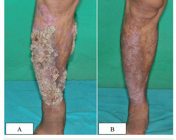
Figure 1. A and B show verrucous hyperkeratotic plaques on right leg before and after 16 weeks of ixekixumab treatment, respectively.

A 35-year-old non-obese male patient, with underlying disease of psoriasis vulgaris since the age of 28, presented with a 3-year history of progressive verrucous plaques on both legs (Figure 1A). Multiple scattered well-defined scaly erythematous plaques were noted on the trunk and the upper extremities (Figure 2). His fingernails showed subungual hyperkeratosis and distal onycholysis. The