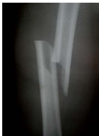
Fig. 2 Radiograph demonstrating a right femoral shaft fracture with similar pattern of Fig. 1