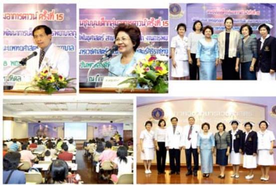
Fig. 7 Siriraj Hospital Down Syndrome Annual Meeting 2006