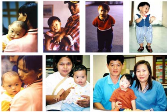
Fig. 15 Children with Down Syndrome