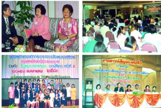
Fig. 10 Down Syndrome Provincial Lecture Tour Eastern (1997), Northeastern (2000), Northern (2001) Thailand

The Sixth in 2004 with Sappasittiprasong Provincial Hospital (covering seven provinces of Ubon Ratchathani, Amnaj Charoen, Srisaket, Yasothon, Nakhonphanom, Roi et, and Mukdahan or Region 14).