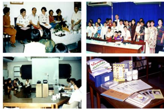
Fig. 5 The Establishment of Down Syndrome Parents' Support Group and its activities