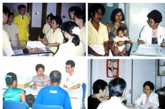
Fig. 2 Counseling, Genetics Clinic

The Second in 2000 with Sakon Nakhon Provincial Hospital (covering six provinces of Mukdahan, Kalasin, Khon Kaen, Loei, Nongkai, and Udonthani or Region 11).