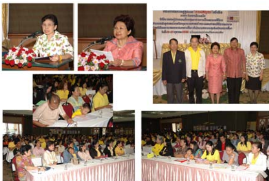
Fig. 11-12 Down Syndrome Lecture Tour – Northeastern Thailand 2006

5. Having worked closely with the Department of Maternal & Child Health, Ministry of Public Health since 1996. As an accomplished outcome, the proposal of establishing “Child Development Center” for the improvement of quality of life of children with DS in every province in the country had been accepted and