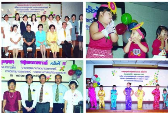
Fig. 6 Educational Program for Parents and Medical Professionals Siriraj Hospital Down Syndrome Annual Meeting (since 1991)