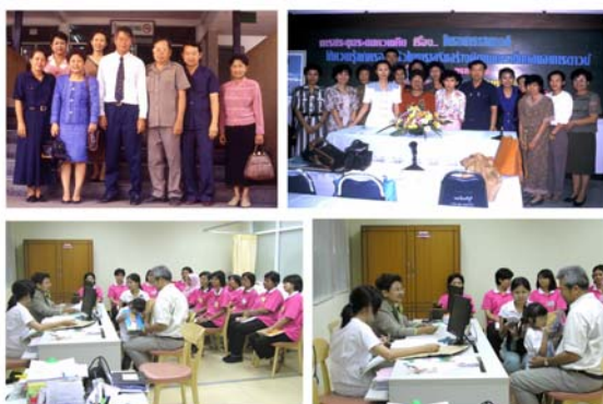
Fig. 8 Working with Ministry of Public Health