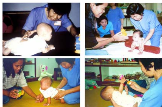
Fig. 3 Early stimulation program (1-3 years)

The Third in 2001 with the Child Development Center, Chiang Mai (covering eight provinces of Chiang Mai, Chiang Rai, Mae Hongson, Lumpun, Lampang Phayao, and Phrae, Nan or Region 1).