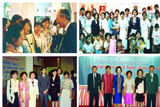
Fig. 9 Participation In Thailand Educational ACT B.E. 2542

The Fourth in 2002 with Hat Yai Provincial Hospital (covering seven provinces of Songkhla, Pattalung, Trang, Satool, Yala, Patani, and Narathiwat or Region 19).