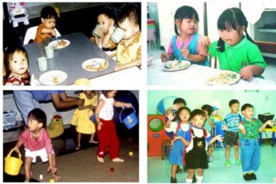
Fig. 4 Preparation for Kindergarten (3-6 years)