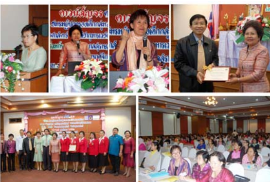
Fig. 13-14 Down Syndrome Lecture Tour – Southern Thailand 2008