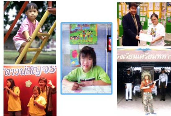
Fig. 16 When a DOWN becomes a STAR

became materialized (Fig. 8). One main aim is to educate the public health professionals and officials to establish a Child Development Center at the community level, so that parents of children with DS will be able to help their children in their respective localities.