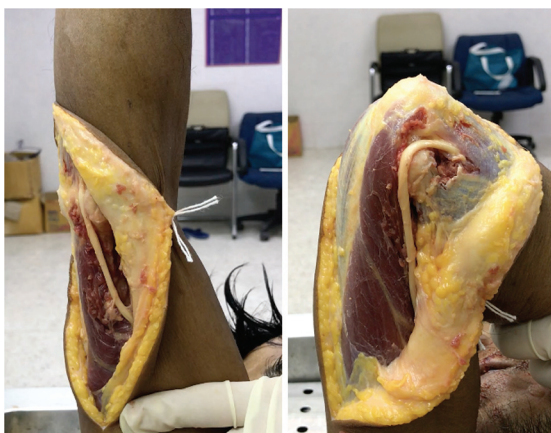
Figure 3. Tested for subluxation by passive elbow extension to full flexion.

hours. Twenty distal humeral bones were completely dissected and measured in both coronal and sagittal