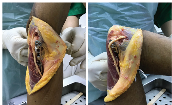
Figure 4. Tested for the area of irritation between plate and nerve by passive elbow extension to full flexion.

hours. Twenty distal humeral bones were completely dissected and measured in both coronal and sagittal