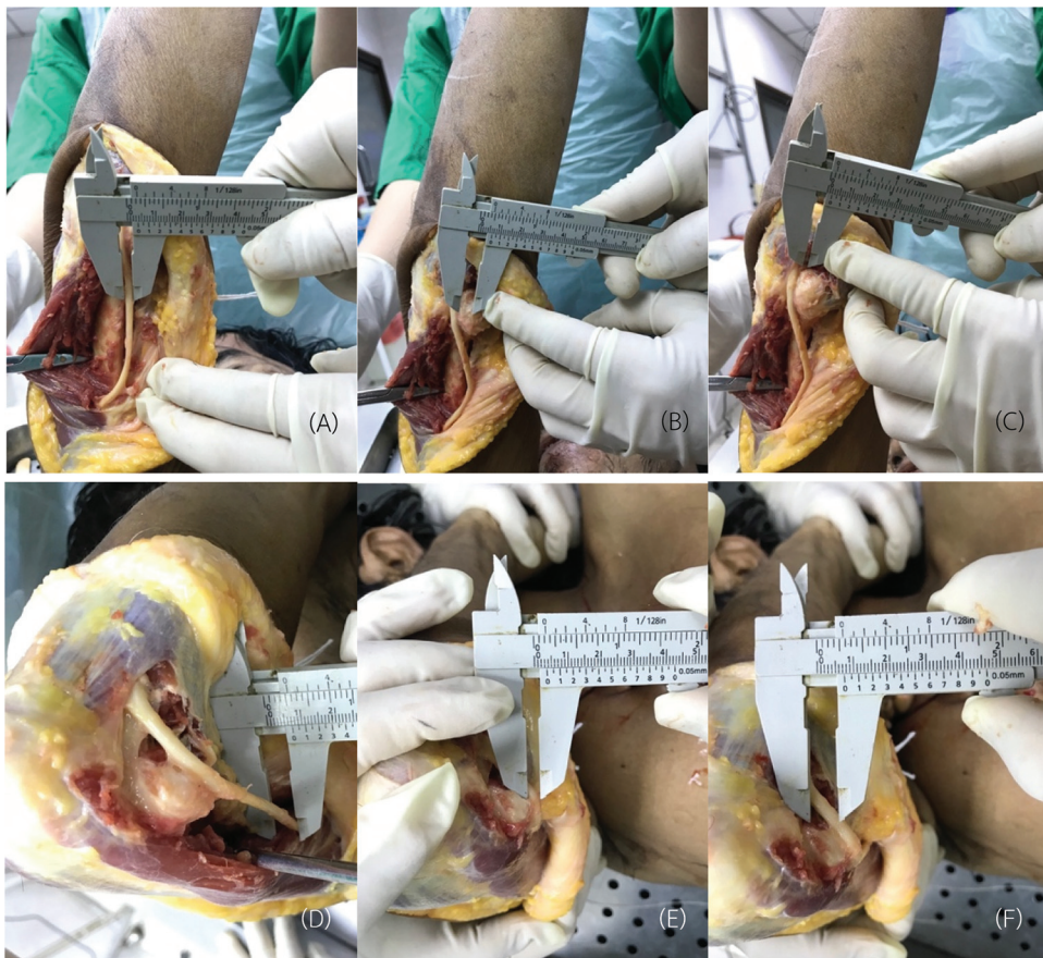
Figure 2. Measurement in the sagittal plane with Vernier caliper in 1/10 mm scale, Full elbow extension at Zone 1: The midline of the medial supracondylar ridge above Landmark 2 about 2 cm (A). Full elbow extension at Zone 2: Central of the most medial point of medial condyle of distal humeral (B). Full elbow extension at Zone 3: The midline of the medial point of the humeral trochlea (C). Measurement in the coronal plane, Full elbow flexion at Zone 1: The medial supracondylar ridge above Landmark 2 about 2 cm (D). Full elbow flexion at Zone 2: The most medial point of medial condyle of distal humeral (E). Full elbow flexion at Zone 3: The medial point of the humeral trochlea (F).