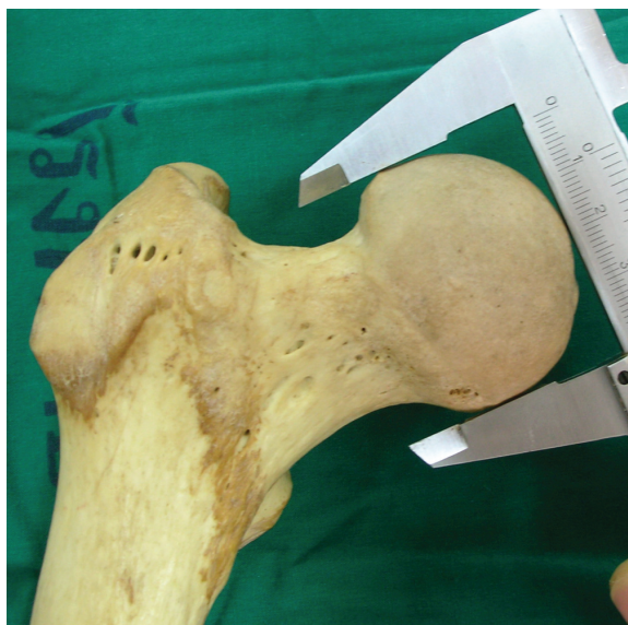
Fig. 1A Measurement of femoral head diameter in coronal plane

With the increasing popularity of hip resurfacing arthroplasty and good short to mid-term