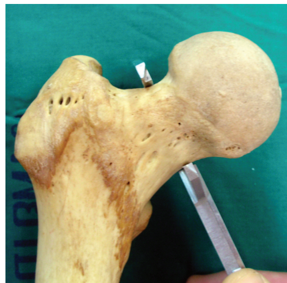
Fig. 1B Measurement of femoral neck diameter in coronal plane