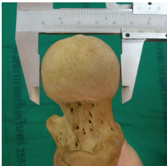
Fig. 2A Measurement of femoral head diameter in sagittal plane