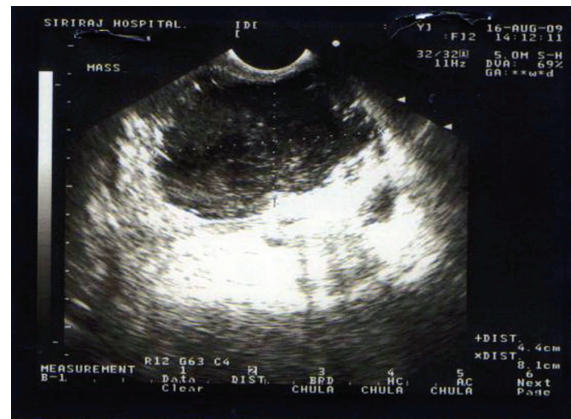
Fig. 1 Transvaginal ultrasonography demonstrated an inhomogeneous cystic mass with irregular thickening border. Scale on the left side represent in centimeter

Pyometra, or the accumulation of pus in the uterus, is a rare event in the general population, but more common in elderly women. It has been reported to account for 0.2-0.5% in gynecologic patients and may rise to 13.6% among elderly patients (2,3) . It is thought to develop as a result of blockage of the natural drainage of the uterus, commonly caused by malignant or benign tumors, surgery, radiotherapy, atrophic cervicitis, puerperal infection, and congenital anomalies (4) . Pyometra develops gradually and progresses to enlarge the uterine size. It is a serious medical condition because its association with danger of spontaneous perforation of the uterus that carries