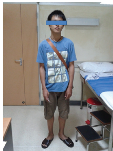
Fig. 2 Forty-nine days post injury, the present patient was able to resume his normal daily activity with good neurological functions.