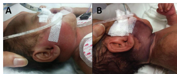
Fig. 1 A) Erythematous, warm, tender, soft tissue swelling in the right submandibular region, extending from his right ear to the upper neck. B) Expanded lesion to right temporal-parietal scalp with discoloration.

Within 72 hours, his lesion had expanded to the right temporal-parietal scalp with discoloration