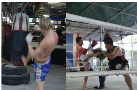
Fig. 2 Unique activities of Muay Thai kickboxers, from kicking and side kicking.

The high prevalence of toe deformities in Muay Thai boxers was associated with prolonged periods of training each week. The prevalence of hallux rigidus in the subjects studied was higher than that in the general population. This may be due to the Muay Thai action of dancing and kicking that regularly uses the first metatarsophalangeal joint (13,14) , putting repetitive force on the sagittal plane. That may also be a cause of osteophyte formation or arthritis (15) . The prevalence of hallux valgus is not different from the general population (16) , which favors the genetic theory of hallux valgus development rather than the effects of shoes or activities (17-19) . Lesser toe deformities are also common and associated with the same factors, but the