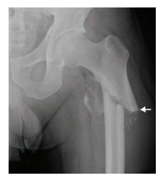
Fig. 4 Radiograph of a 56-year-old Thai man with proximal femoral fracture after sustaining a motorcycle accident approximately 3 months prior to presentation at our institution. Plain radiograph of left hip showed evidence of atypical femoral fracture including short oblique fracture configuration, non-comminuted fracture, medial cortical spike and localized thickening of the lateral femoral cortex (arrow). There was also callus formation around the fracture site which corresponded to the chronicity of the fracture.

5.7% of atypical femoral fracture among Thai patients who presented with subtrochanteric/femoral shaft fracture at a single institution. The prevalence of atypical femoral fracture that has been reported specifically in Asian countries ranged from 0.8% to 35.1% (Table 3)<sup>(13-15)</sup>. The reasons for this large discrepancy are unclear. It is possible that each study used different definition, population sample, or duration of data collection and methods to identify atypical femoral fracture cases.