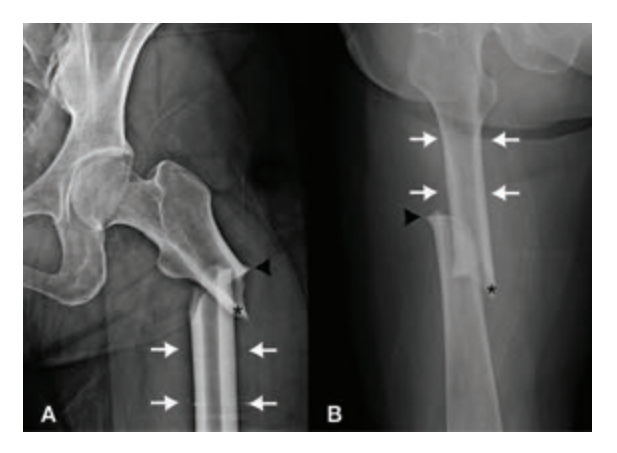
Fig. 1 Radiographs of patients diagnosed with atypical femoral fractures. The radiographic features of an atypical femoral fracture are shown including transverse or short oblique fracture configurations, non-comminution, medial cortical spike (asterisks), localized periosteal thickening of the lateral femoral cortex (black arrowheads), and generalized cortical thickening (white arrows).

Following an Institutional Review Board approval, the authors retrospectively reviewed plain radiographs of 856 patients who were diagnosed with subtrochanteric/femoral shaft fractures between January 2002 and October 2013 at Siriraj Hospital, Bangkok, Thailand. Patients with inadequate radiographs, aged less than 20 years, associated with intertrochanteric or femoral neck fractures, multiple injuries, pathological or periprosthetic fractures were excluded. From 856 cases, only 435 patients met the inclusion and exclusion criteria and were included into the present study. The location of fractures was divided into subtrochanter (within 2.5 cm of the lesser trochanter) and femoral shaft (distal to subtrochanter to just proximal to the supracondylar flare). All radiographs were reviewed by one investigator (SL) and then confirmed with the senior author (AU). From 435 cases, only those who had major radiographic features of atypical femoral fracture according to the 2010 ASBMR criteria were included (Fig. 1). The patient was included and designated as a case only when both investigators agreed that the radiographs showed an atypical femoral fracture pattern. Both investigators were blinded to the patients' information