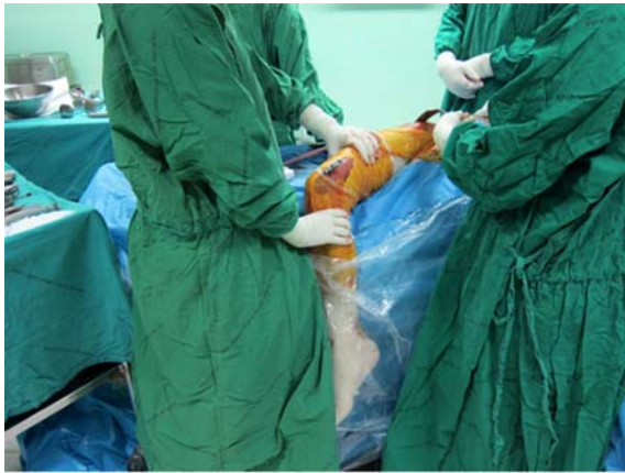
Fig. 2 The patient's leg was dropped anteriorly to perform the femoral stem.

Abduction-S3.1 and Anteversion-S3.1. This process was repeated by both (S2) and (S3) and the final cup positions were recorded as Abduction S2.2, Anteversion S2.2, Abduction S3.2 and Anteversion S3.2 respectively. Patients' age, gender, BMI and diagnosis were recorded as demographic data.