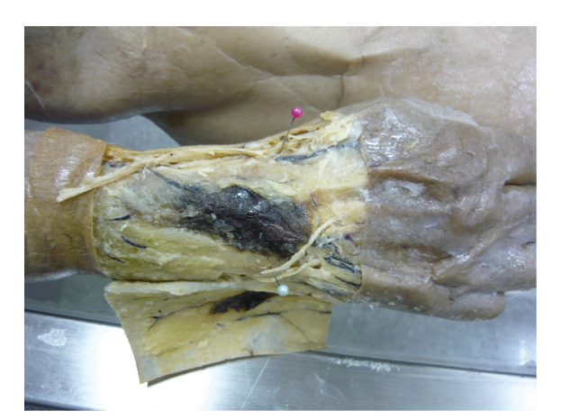
Fig. 1 The formalin preserved cadaveric dissection. The pins were placed at the tip of radial styloid and ulnar styloid.

The patient was informed about the risk and benefit of the procedure, including the chance of success or failure of the procedure that could not be