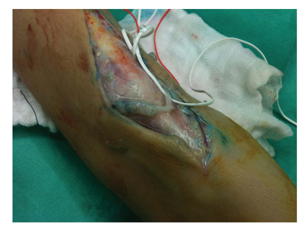
Fig. 3 The final transfer was demonstrated. The larger nerve on the left side was the superficial radial nerve. The smaller nerve was the first branch of dorsal ulnar cutaneous nerve.

Negative value denote the location at radial and proximal to the ulnar styloid.