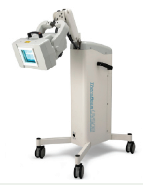
Figure 1. TheraBeam (Ushio).

The sample size was calculated according to the study of Shroff et al<sup>(10)</sup>, which the primary outcome was improvement of the physician global assessment (PGA) score and the mean difference was 1.8 point with a standard deviation (SD) of 3.6 points, Therefore, the sample size required