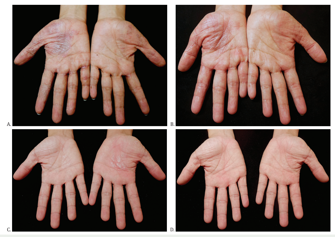
Figure 4. Chronic hand dermatitis before (A, C) and after (B, D) 308-nm xenon chloride monochromatic excimer light treatments with satisfaction with improvements.

dorsal sites were 4445.13 mJ/cm² and 2394.76 mJ/cm². The clearance of the disease, defined by clear lesions and symptoms with no new disease activity development after complete protocol, was achieved in 19 to 34 patients (55.88%). In addition, the disease activity was also recorded after two weeks of completed treatment to observe recurrences. There was no statistically significant change of HECSI, PGA, NRS, and erythema index immediately and two weeks after treatment.