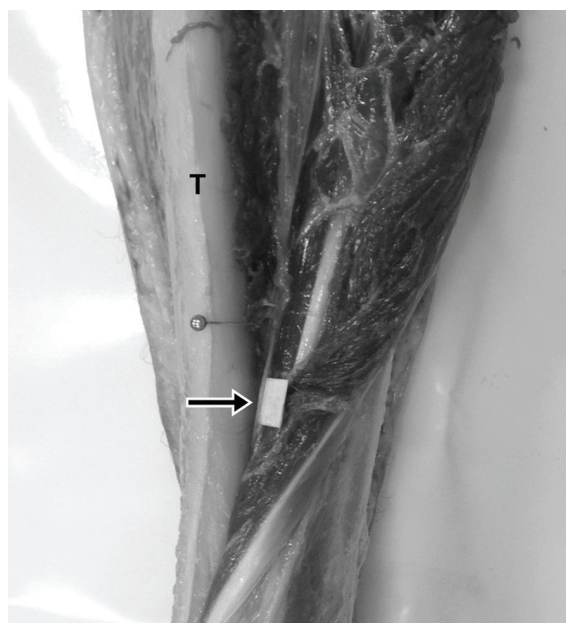
Fig. 1 Dissected left leg of a cadaver showing the deep peroneal nerve (arrow) just lateral to the anterolateral surface of the tibia (T). The muscles of the anterior compartment of the leg are partially reflected laterally for visualization purposes.

The data were further analyzed by dividing the range of DPN locations into five intervals and determined the frequency of DPN in each interval. As