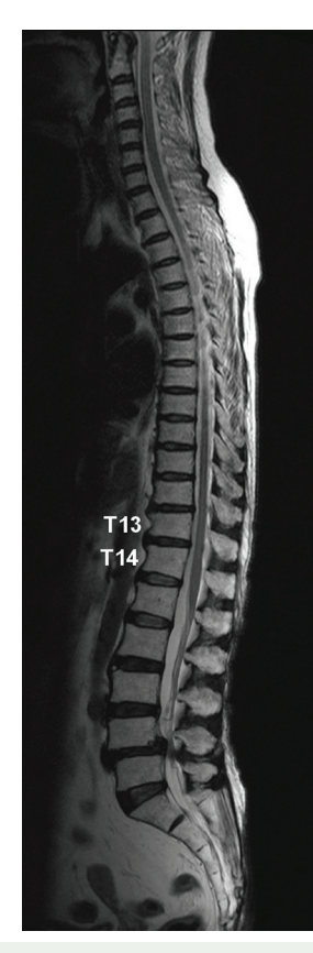
Figure 2. The complementary sagittal T2-weighted MRI of the whole spine showing 26 presacral mobile segments.

From the literature review, the authors found 75% of 44 patients with tracheoesophageal fistula that have extravertebrae, predominantly in the thoracic spine. Stevenson theorized that hypersomatization secondary to excessive flexion of