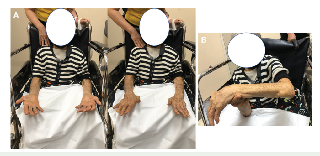
Figure 3. Final clinical outcomes at 2.5 years follow-up. The patient had nearly similar range of motion for both elbows (A), with bony prominence on the proximal ulna fracture site (B).