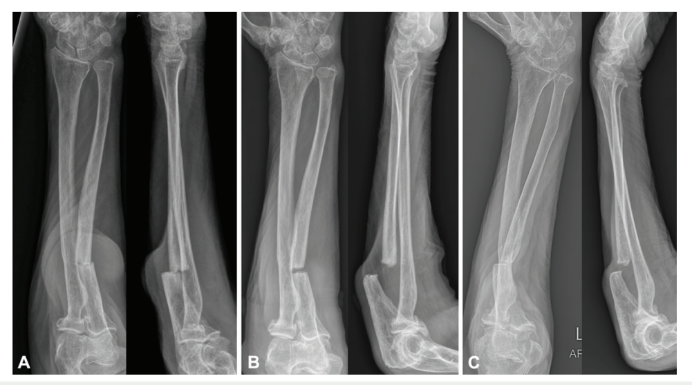
Figure 2. Follow-up radiographs of the atypical fracture of proximal ulna at 5 months (A), 14 months (B), and 2.5 years (C) showed progressive displacement and nonunion without callus formation.