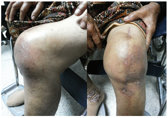
Fig. 4 Condition six months after the first stage operation of case 2. Six months after the operation, there was some knee swelling but without discharge.