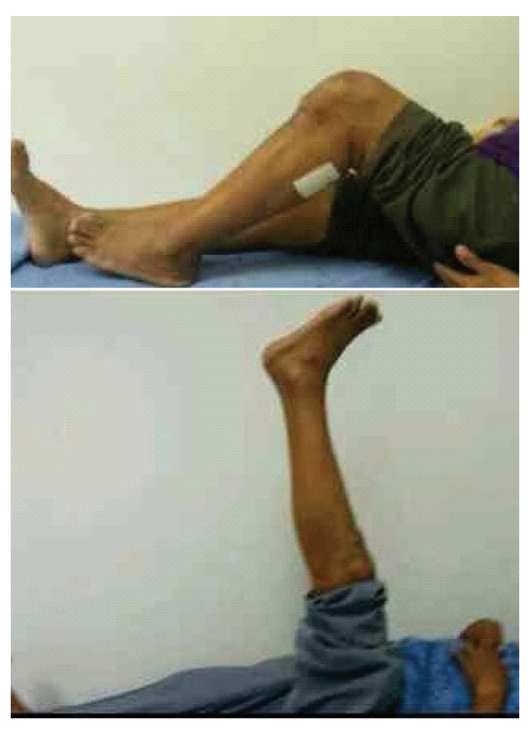
Fig. 2 Postoperative reimplantation. Range of motion, active flexion (above) and active extension (below) with a good extensor mechanism.