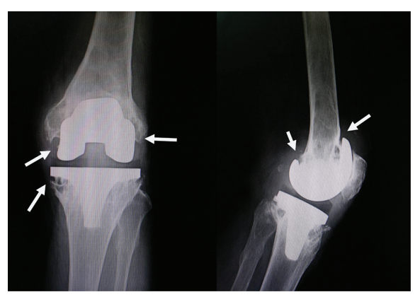
Fig. 3 Preoperative radiography of case 2: Osteolytic lesion around the prosthesis on both the femoral and tibial side.

Fungal periprosthetic joint infection was first reported in 1979 by MacGregor et al<sup>(1)</sup>. Between 1979 and 2000, there were fewer than 100 cases of PJI due to Candida spp. described n the medical literature, although some cases maynot have been reported so the total may be higher. Most fungal infections are due to Candida albican. Other fungal species causing infection are those from the genus Aspergillus<sup>(2)</sup>. Factors linked with contracting fungal PJI include immunosuppression, neutropenia, chronic or prolonged use of antibiotics, the presence of indwelling intravenous catheters, parenteral hyperalimentation, malnutrition, diabetes mellitus, rheumatoid arthritis, cirrhosis, a history of multiple abdominal surgeries, a history of renal transplantation, severe burns and injection of drugs<sup>(3)</sup>. Risk factors for Candidiasis infection include haematological malignancy, neutropenia, age under month or over 65 years, and recent abdominal surgery<sup>(4)</sup>. Risk factors for Aspergillosis infection include acute myelogenous leukaemia or myelodysplastic syndrome during remission induction chemotherapy for patients undergoing allogeneic haematopoietic stem cell transplantation; recipients of solid organ transplants