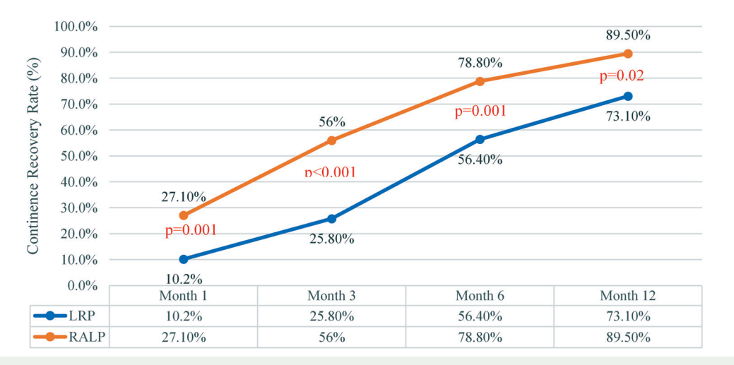
Figure 2. Continence rate at 1, 3, 6, and 12 months after surgery.