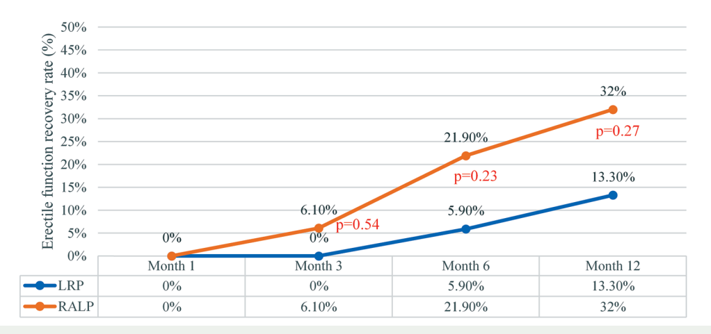
Figure 3. Potency rate at 1, 3, 6, and 12 months after surgery in patient with bilateral NVBs preservation.

techniques were widespread procedures and became the new standard treatment in localized prostate cancer especially in Europe and the USA.