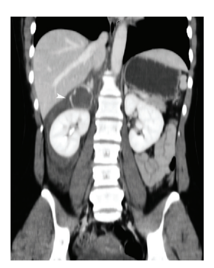
Fig. 1 The CT scan abdomen shows a rim enhanced heterogeneous hypo-hyperdense lesion at the right suprarenal region (arrowhead).

The following laboratory parameters were noted: hemoglobin 10.9 g/dL, WBC 10.6x10³/mm³ (N 93%, L 4.1%, and M 2.9%), platelet count 160x10³ mm³, sodium 137 mmol/L, potassium 3.92 mmol/L, chloride 106 mmol/L, bicarbonate 25 mmol/L and cortisol 28.8 mcg/dL Computed tomography (CT) scan showed a 4.0x3.4x4.5 cm rim enhanced heterogeneous hypo-hyperdense lesion at the right suprarenal region, partly abutting to the right adrenal gland. There was a non-enhancing fluid-filled density (25-30 HU) within the right paranephric space and right retroperitoneal space. Minimal fat reticulation at the right retroperitoneal area was detected. Apart