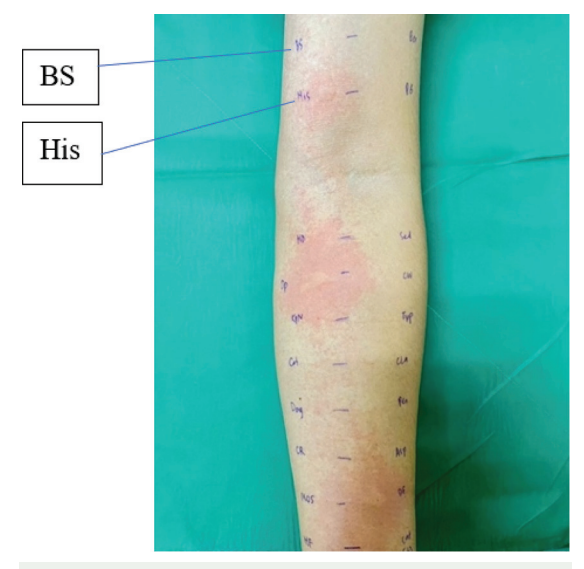
Figure 1. Skin prick test on a patients' arm showing positive results for certain allergens.

Data analyses were performed using PASW Statistics, version 18.0 (SPSS Inc., Chicago, IL, USA). Descriptive statistics, such as the mean with the standard deviation or median with the minimum and maximum values, were used for the continuous variables that depended on the distribution of the data, while the frequency and percentage were used for the categorical variables. Pearson's chi-square was performed to determine the association between the descriptive data and the skin prick test results. The mean differences between groups were compared using the Mann-Whitney U test. A p-value less than