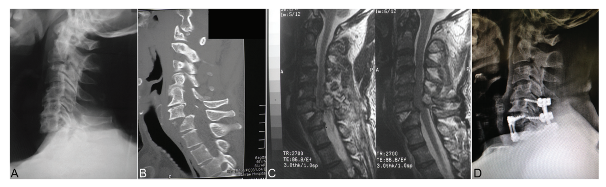
Fig. 2 Old/delayed bilateral facet dislocation with myelopathy (case No. 8). A) Lateral view of the cervical spine showed old bilateral C6-C7 facet dislocation. B) CT scan showed anterior translation C6 over C7 with posterior element fracture. C) MRI showed spinal cord compression without intervertebral disc herniation. D) Combined posterior-anterior fixation was performed.

Postoperative imaging showed improvement of the spinal alignment. Translation of the upper