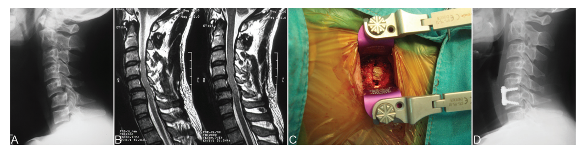
Fig. 3 Old/delayed unilateral facet subluxation with myeloradiculopathy (case No. 7). A) Lateral view of the cervical spine showed unilateral C5-C6 facet subluxation with rotational component. B) MRI showed anterior translation C5 over C6 without intervertebral disc herniation. C) Anterior Cervical Discectomy and Fusion was performed. D) Postoperative radiograph showed anatomical reduction of C5-C6 facet joint. Solid bony fusion was achieved 3 months after surgery.

Fig. 2 Old/delayed bilateral facet dislocation with myelopathy (case No. 8). A) Lateral view of the cervical spine showed old bilateral C6-C7 facet dislocation. B) CT scan showed anterior translation C6 over C7 with posterior element fracture. C) MRI showed spinal cord compression without intervertebral disc herniation. D) Combined posterior-anterior fixation was performed.